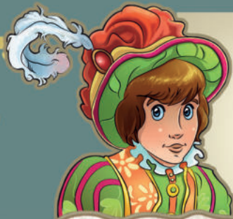
Edward Tudor, Prince of Wales

... is the son of King Henry VIII. He lives a rich life inside the royal palace, but has no freedom. He is a kind and fair boy, but wishes he could be free and play in the streets like a simple child.