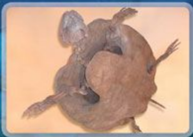
Prehistoric sea turtle at the Museum of Natural History NYC

Sea turtles' shells are perfectly designed for gliding through the sea. Unlike other turtles, sea turtles can't pull their head and legs back into their shell. Their colour varies from species to species, but they are most often yellow, green or black.