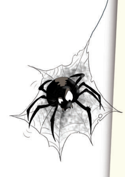
Scene 1 Part 2