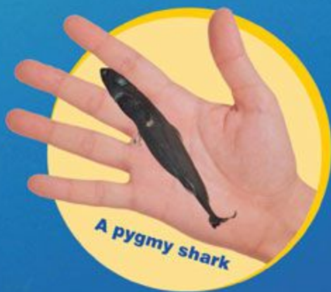
A pygmy shark