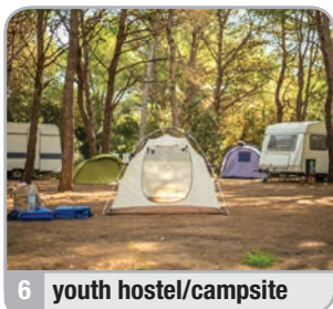
6 youth hostel/campsite