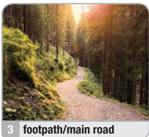
3 footpath/main road