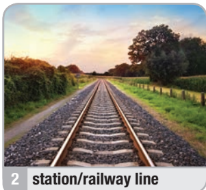
2 station/railway line