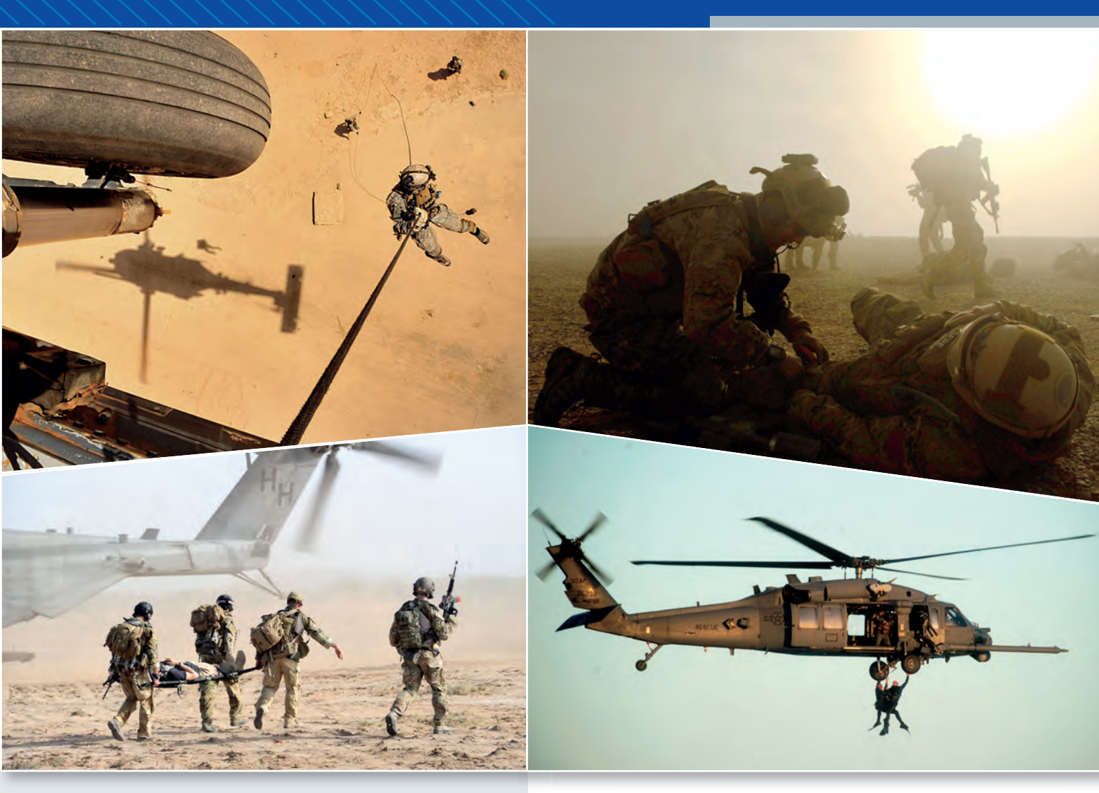
PJs carrying out search and rescue operations

"That others may live": that is the motto of the Air Force's Special Operations pararescue technicians.