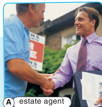
A estate agent