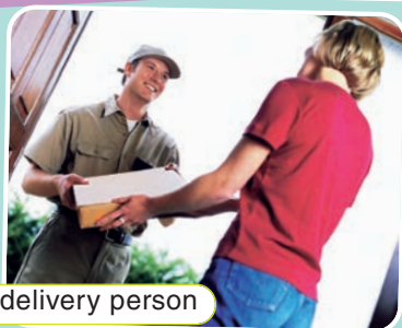
B delivery person

If I was offered a choice between working as a shop assistant and working as a delivery person, I think I'd probably opt for the shop assistant job. You get to meet and talk with people in 1) ..... jobs, but it seems to me you would have more chances to speak to people as a shop assistant. Also, when you are a delivery person you have to be able to drive either a van or a bike 2) ..... when you're a shop assistant you don't. Also, delivering things involves being out in all weathers, 3) ..... when you work in a shop you don't have to go outside. 4) ..... being a shop assistant nor being a delivery person pays very well. 5) ..... , I think when you work in a shop you get a discount on what the shop sells. I think maybe that is the main reason why I'd want to work as a shop assistant 6) ..... work as a delivery person.