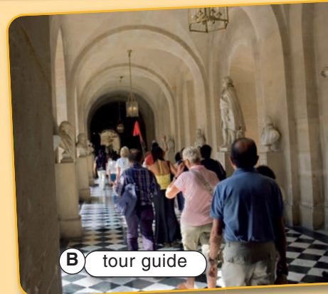
B tour guide